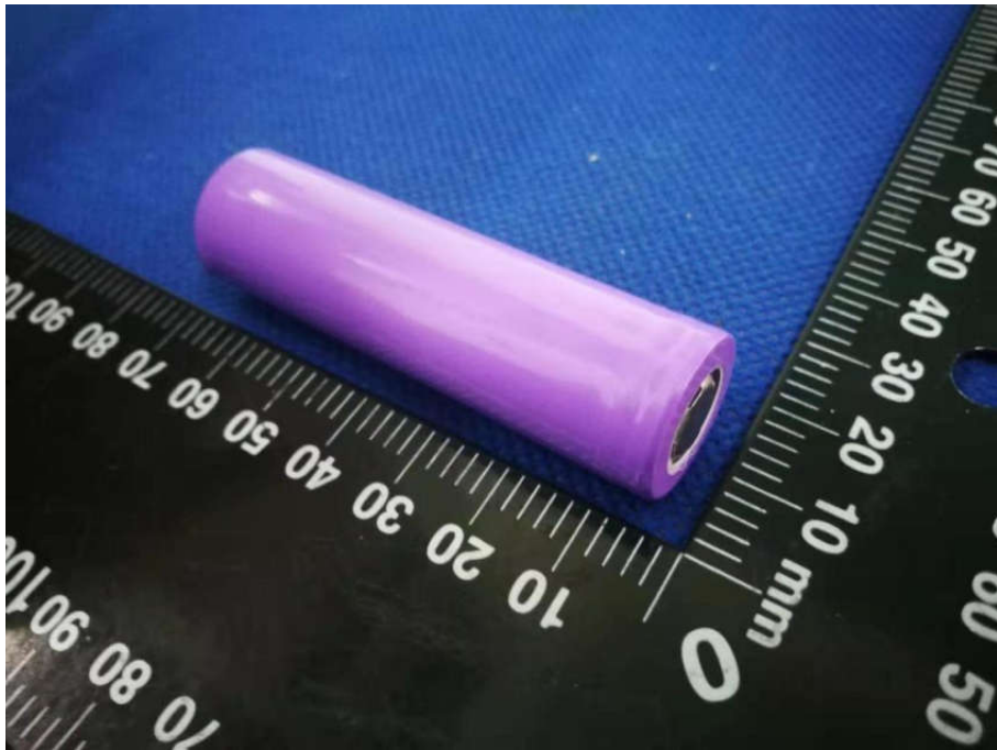
电池外观 Cell appearance