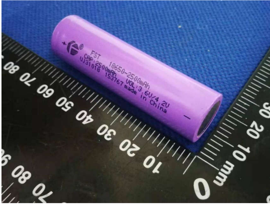
电池外观 Cell appearance