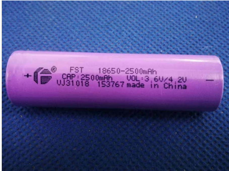
电池铭牌 Cell Nameplate